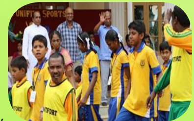
Unified Sports Meet at Monfort School, St. Thomas Mount