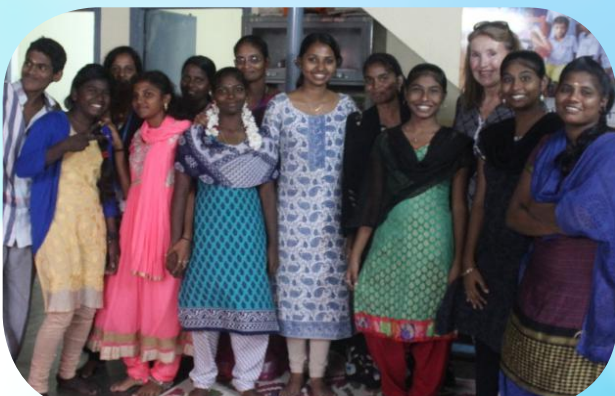
Young and energetic Open School students at Kannagi Nagar