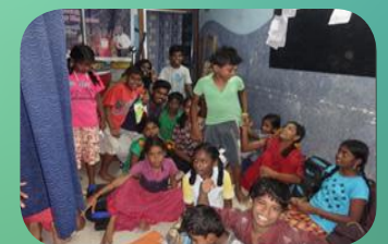
Happy Adyar Study centre children