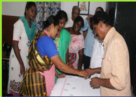
Block Printing unit of MCDS