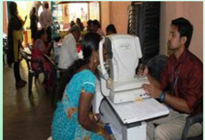
Eye Screening in collaboration with India Vision Institute & Sankara Nethralaya