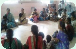
Monthly Parents meeting of our Special Children