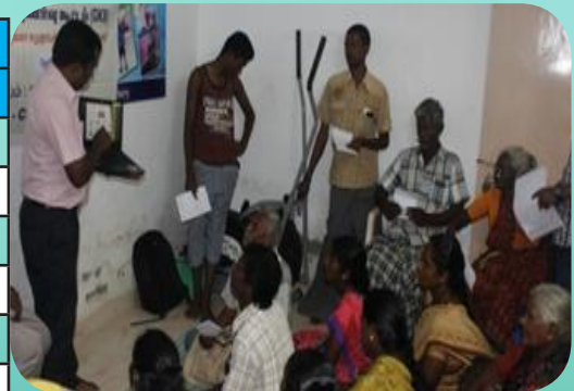
TB Awareness and Screening by REACH for our SHG groups