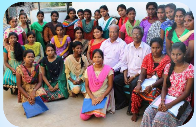
Youth who participated at the three days seminar