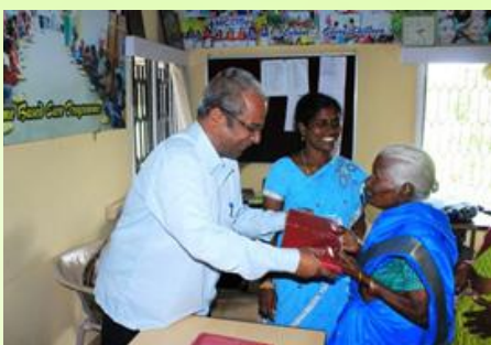
Distribution of Uniform Sarees to all members

Our Senior Citizens Forum consist of 40 Elders in two centres, one at Srinivasapuram and the other at Nochi Nagar. They gather in the evenings for their activities which includes Prayer, Yoga, Meditation, Newspaper Reading, Sharing stories, Singing & Dancing. They actively participated in Pongal, Elder's Day and Christmas celebrations. They also availed programmes like T B Awareness, Ortho and Eye camp. Uniform sarees were distributed to them.