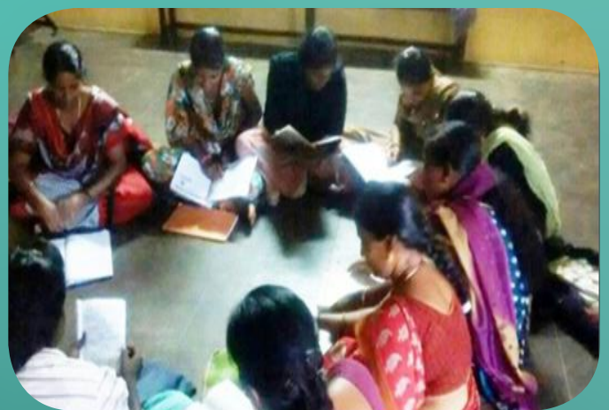
Students busy preparing for their exams