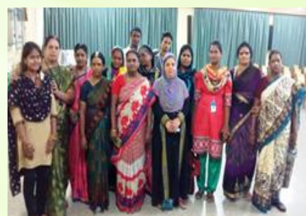
Our women leaders at a workshop organised by Cancer Institute