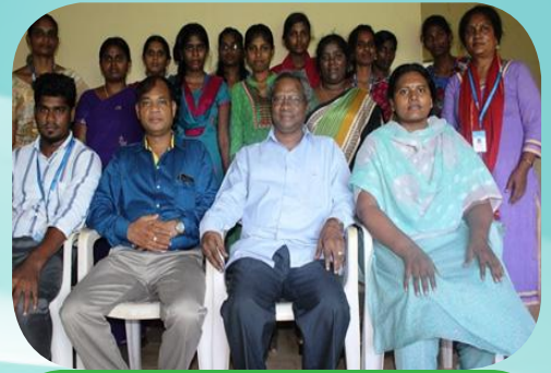
Our Study Centre Teachers at the Annual Training Programme