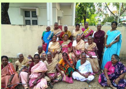
One group of our Senior Citizens