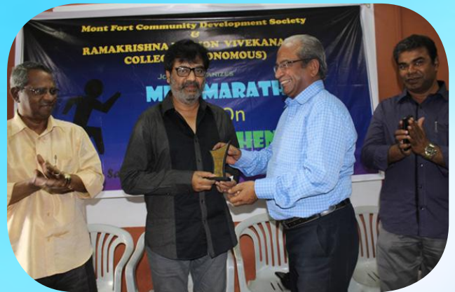
Mr. Vivekh, an Alumni of Santhome Hr. Sec. School, the reputed cine actor cum comedian presided over the prize distribution