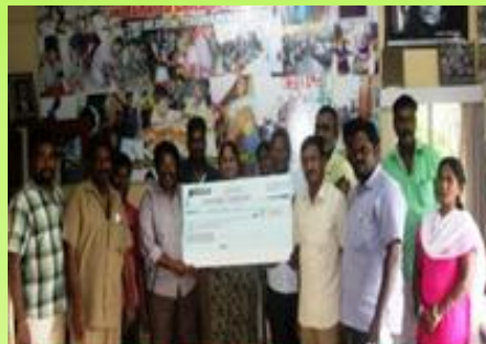
Distribution of bank loan

Our Men SHG group is a unique feature of MCDS. The Federation consisting of 80 members are divided into 5 Groups. They are mostly Auto drivers. MCDS assist them in getting new autos through bank loans.