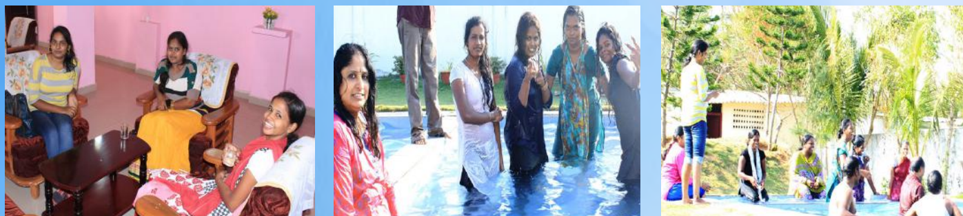
Staff relaxing after the three full days of evaluation

From the dawn of year 2016 when MCDS was fully immersed in the Relief work after the "Chennai Floods" and Ending the year with the Vardah Cyclone, the year has been Fulfilling and Fruitful in its manifold activities throughout the year. All these achievements were made possible because of the committed engagement of MCDS as a whole and on account of our dedicated staff along with our collaborators in our mission. We gratefully acknowledge the financial support we received from our Funding Partners and thank them wholeheartedly for the implicit faith reposed in MCDS.