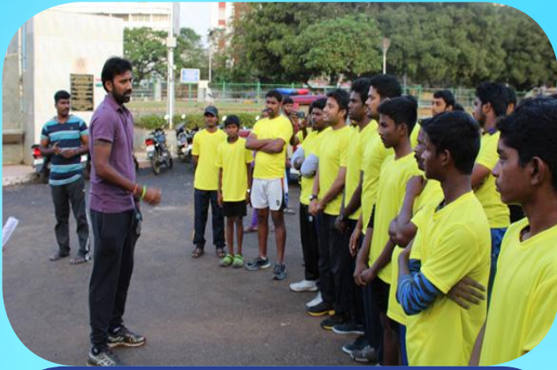
Youth participating in Mini Marathon for the cause of Clean Chennai. Indian Cricketer, L. Balaji flagged off the marathon