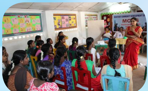
Youth attentively participating in Seminar