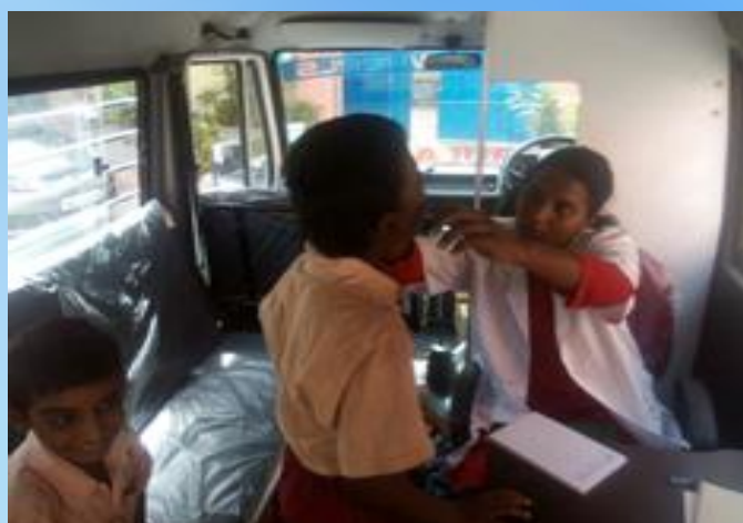
Our Dentist checkup a patient