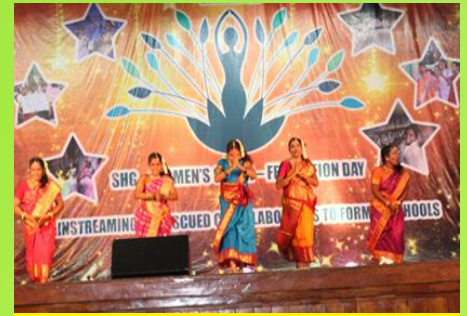
SHG Members at their best on International Women's Day