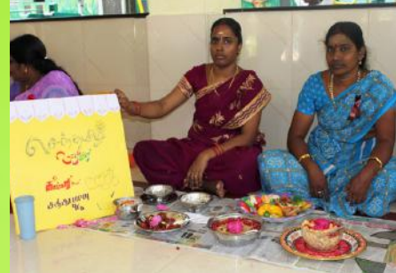
Cooking without fire – a competition by one of the Federation for all their groups