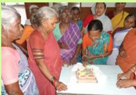
Elder's Day celebrations