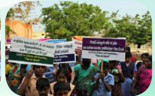
World Disability Day Rally for our Special Children along with their parents and local people