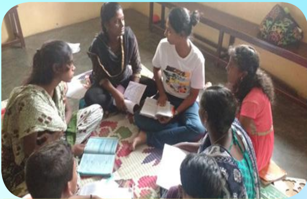
Open School students clearing their doubts