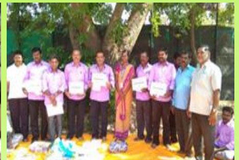
Men SHG award ceremony