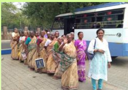
Picnic for our Elders