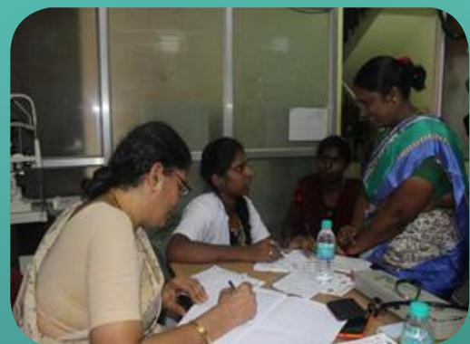
Kidney Screening in collaboration with TANKER Foundation