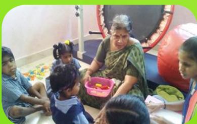
Assessment/Evaluation of our Special Children in Chemmancherry by Resource Person from Vidya Sagar

MCDS started with One CBR centre in the slums of Srinivasapuram. After the Tsunami, the slum dwellers were relocated in Kannagi Nagar and Chemmencherry. The Tamil Nadu Slum Clearance Board made a request to MCDS to start a centre each in these two relocated areas. It is after the Chennai Floods '2015' that a further request was made to start one more centre at Perumbakkam. Thus we have Four CBR centres in the slums and slum relocated areas. The Four centres now have been divided into two groups, considering their age factor. The centres at Srinivasapuram and Perumbakkam are meant for those above sixteen years of age. They are given Vocational training to make them independent. The other two centres at Kannagi Nagar and Chemmencherry cater to those below sixteen years. They are given systematic training to look after their own needs and become independent. The mildly affected ones among them are given training to admit them in normal schools and thereby mainstream them. They are also given Physiotherapy by a qualified Physiotherapist.