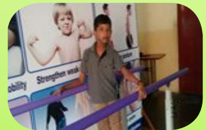
Our Special Children availing Therapy Equipment facility

MCDS started with One CBR centre in the slums of Srinivasapuram. After the Tsunami, the slum dwellers were relocated in Kannagi Nagar and Chemmencherry. The Tamil Nadu Slum Clearance Board made a request to MCDS to start a centre each in these two relocated areas. It is after the Chennai Floods '2015' that a further request was made to start one more centre at Perumbakkam. Thus we have Four CBR centres in the slums and slum relocated areas. The Four centres now have been divided into two groups, considering their age factor. The centres at Srinivasapuram and Perumbakkam are meant for those above sixteen years of age. They are given Vocational training to make them independent. The other two centres at Kannagi Nagar and Chemmencherry cater to those below sixteen years. They are given systematic training to look after their own needs and become independent. The mildly affected ones among them are given training to admit them in normal schools and thereby mainstream them. They are also given Physiotherapy by a qualified Physiotherapist.