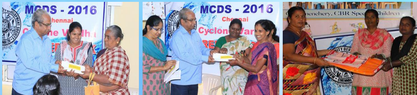
Relief Distribution by MCDS to some of the Affected Families

Cyclone 'Vardah' played havoc to the Chennai city and suburbs and caused untold sufferings and disaster to the slum dwellers, many of whom are our beneficiaries. We visited the affected areas to extend our helping hand. It is heart rendering to see the trees twisted and uprooted in every nook and corner of the city. Our two Ambulance vehicles, parked in front of MCDS was miraculously saved from the damage even though, broken branches fell all around them. The city is limping back to normal.