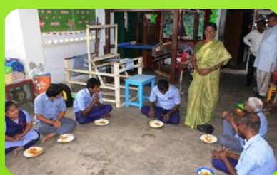
Lunch at one of our CBR centres