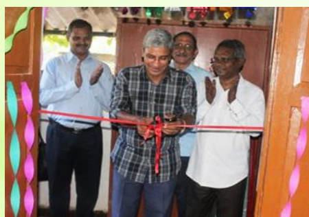
Inauguration of Block Printing Unit by Rotarians