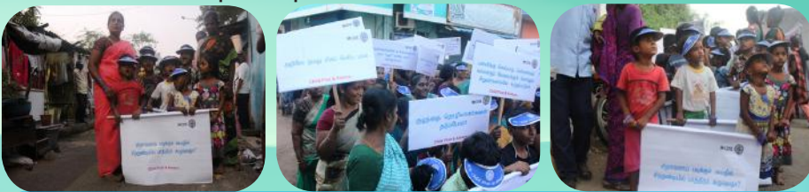
Child Rights Rally by our students, parents and SHG members