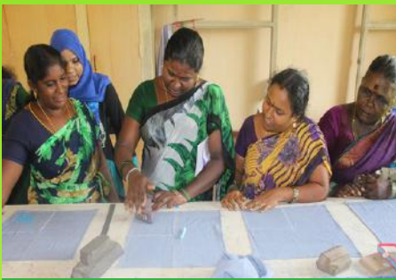
Block Printing Training at Krupa Trust, Padappai