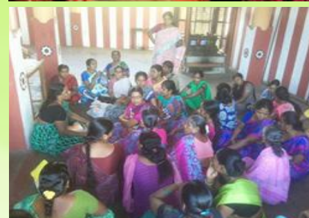
Monthly meeting of all members of Federation