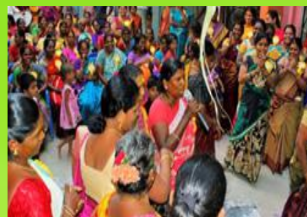
Pongal Celebrations at Federation Level

Total Number of SHG members – 1820 Women