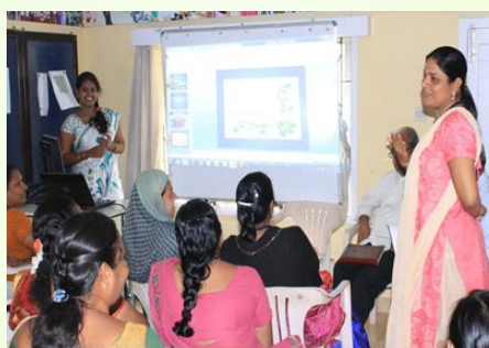
Super Federation meeting with the Federation Leaders and Cabinet Ministers