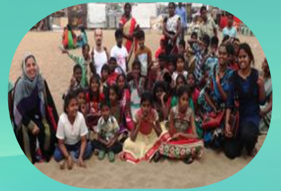
Two Study Centre children on their picnic