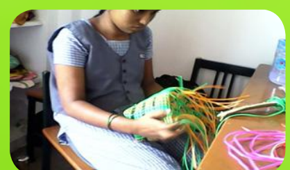
Vocational skill training for our CBR Youth